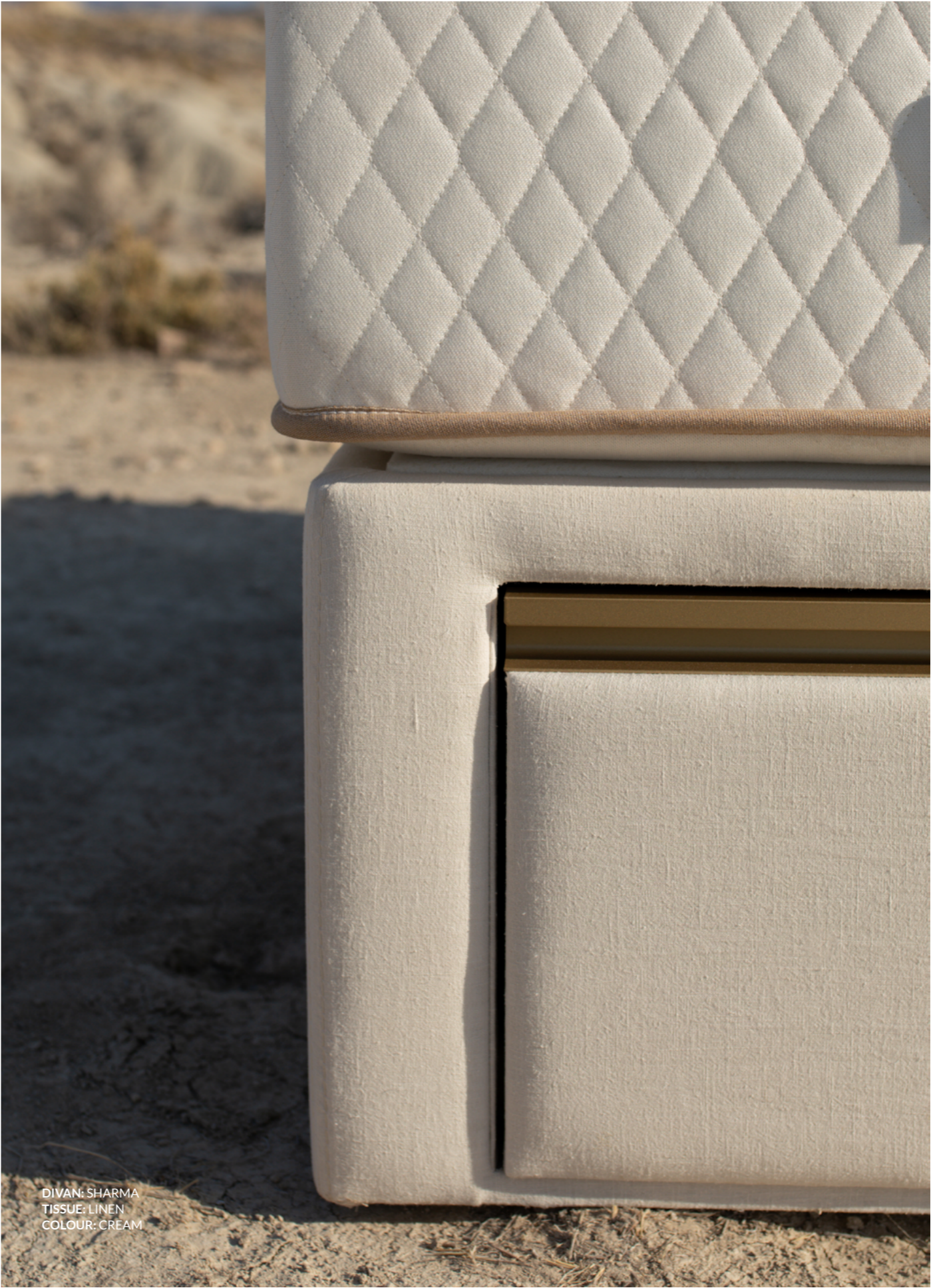
DIVAN: SHARMA TISSUE: LINEN COLOUR: CREAM