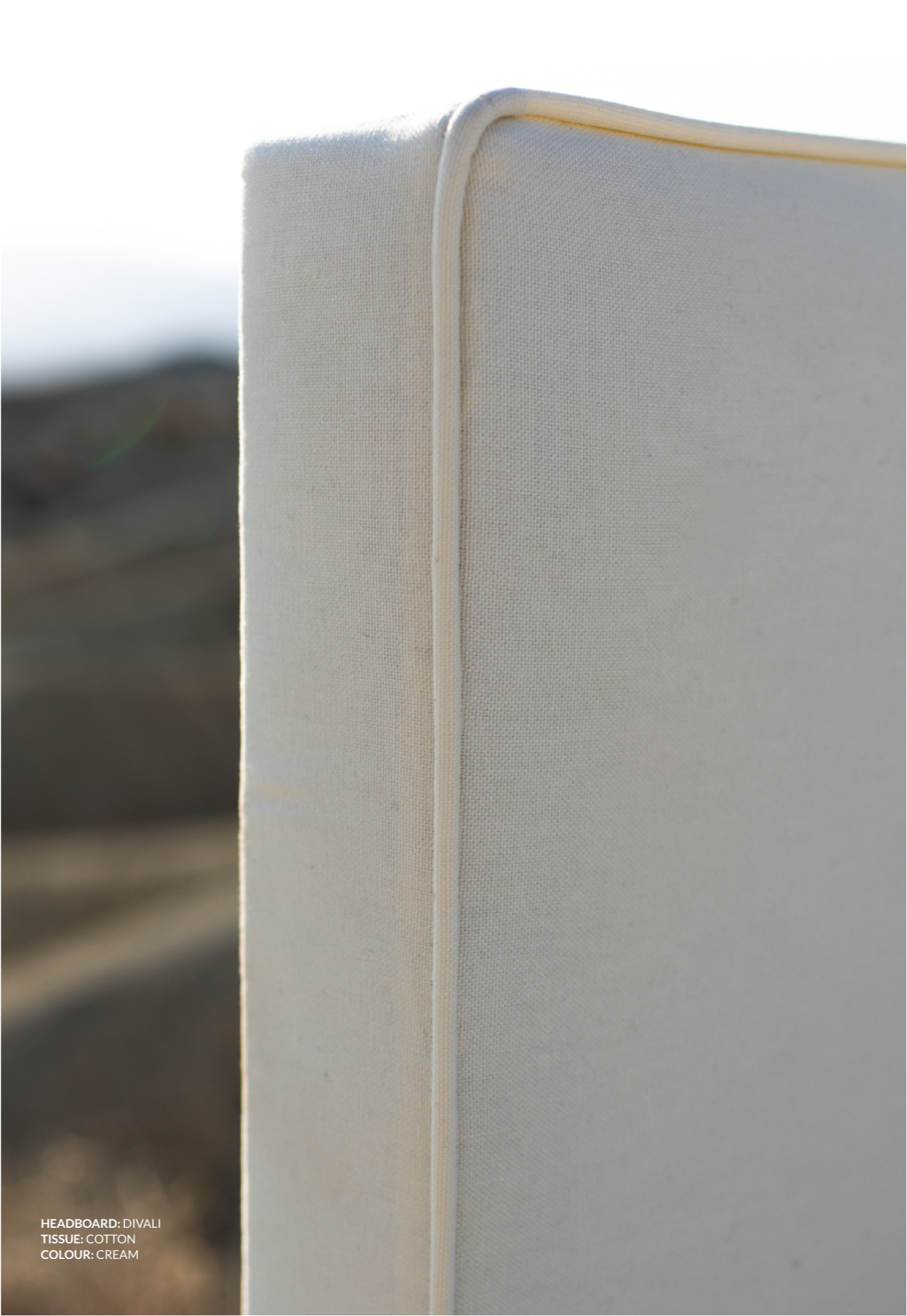
HEADBOARD: DIVALI TISSUE: COTTON COLOUR: CREAM